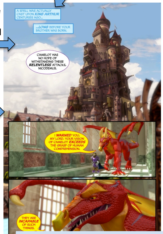
The Dreamland Chronicles by Scott Sava www.thedreamlandchronicles.com

Bleed is when an image goes all the way to the edge of a page.